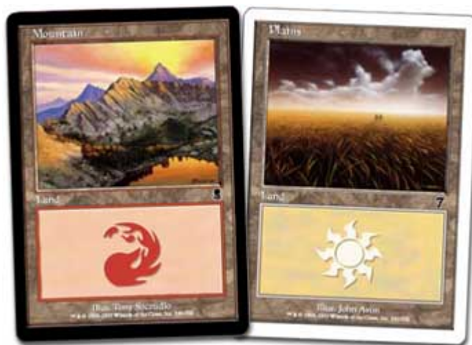
"Alan's Psychedelic Breakfast" and "Grantchester Meadows"

I love Pink Floyd. They're one of my favorite bands, and the following deck wound up being one of my favorites as well. While picking the decks to showcase here, I was, of course, very subjective. I looked for both how well the deck worked and how well the thematic connections worked, but since most people's decks were excellent on both counts, I fell back on how interesting I thought the deck was. This deck was created by an over-40 player who's been into Magic for less than a year. And although it needs more land, it's otherwise great. Check out his fantastic card-song connections, noting that some (like